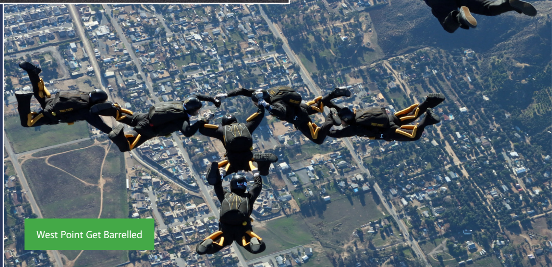
West Point Get Barrelled