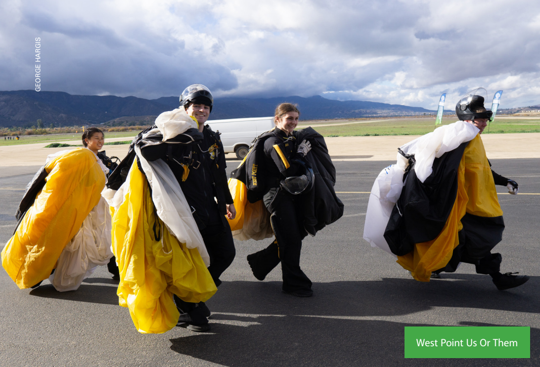
West Point Us Or Them